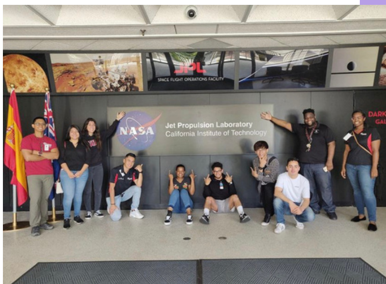
CSUN SWE Tour at Jet Propulsion Laboratory