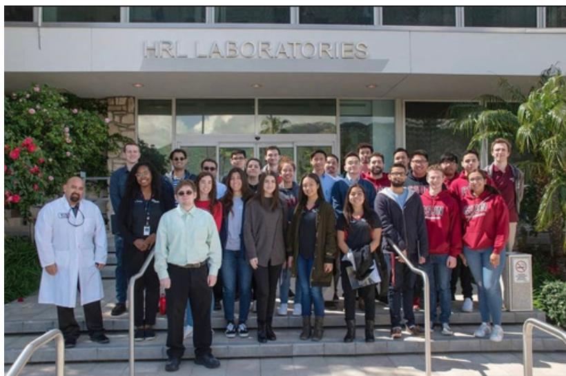
SWE, NSBE, SHPE and ASME Tour at HLR Laboratories