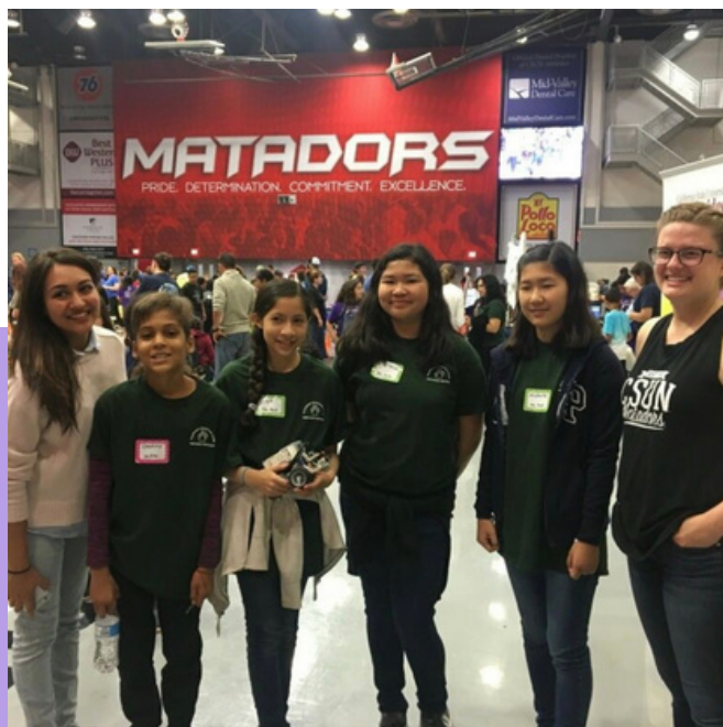
SWE at the Rally in the Valley Encouraging the Next Generation of Engineers