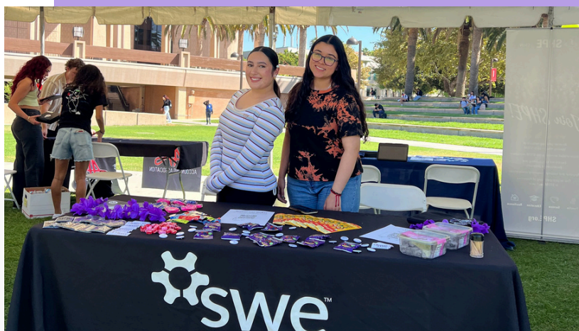
SWE President and Vice President at 2024 Meet the Clubs