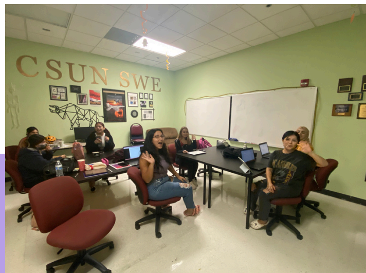
SWE Members Encouraging and Supporting Each Other at the SWE Room