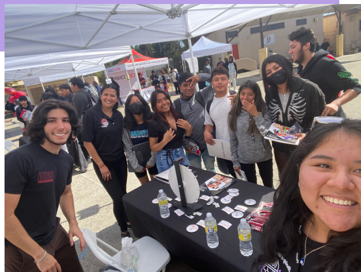
SWE, ASME, and SHPE at the Owensmouth Adult High School Encouraging Students to Continue College