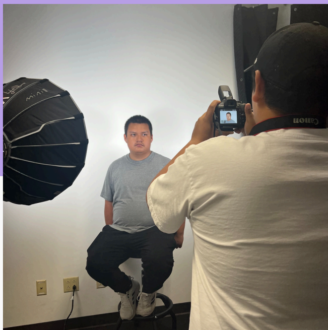
SWE x SHPE Headshot Day in Preparation for the Conferences