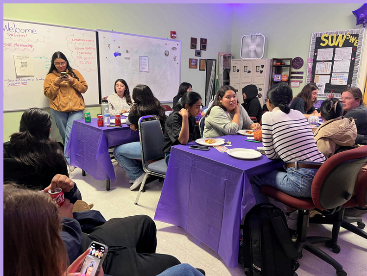
SWE Members at the first general meeting, 2024